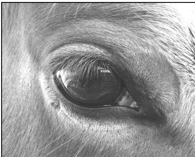
Miss Piggy's eye after injury. The hole in the inside top is completely undetectable. The only thing visible is the tiny scar where her eye was ripped on the bottom.